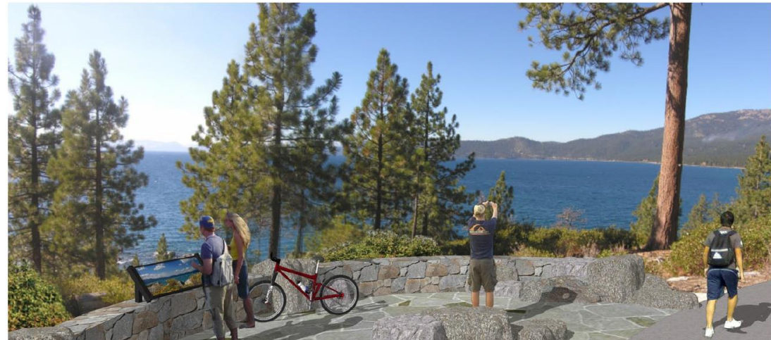
Conceptual illustration of viewpoint along proposed Bikeway. (Actual design may vary.)