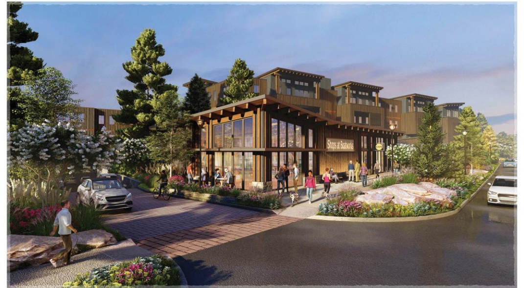
View of ground floor retail and condominiums from SR28