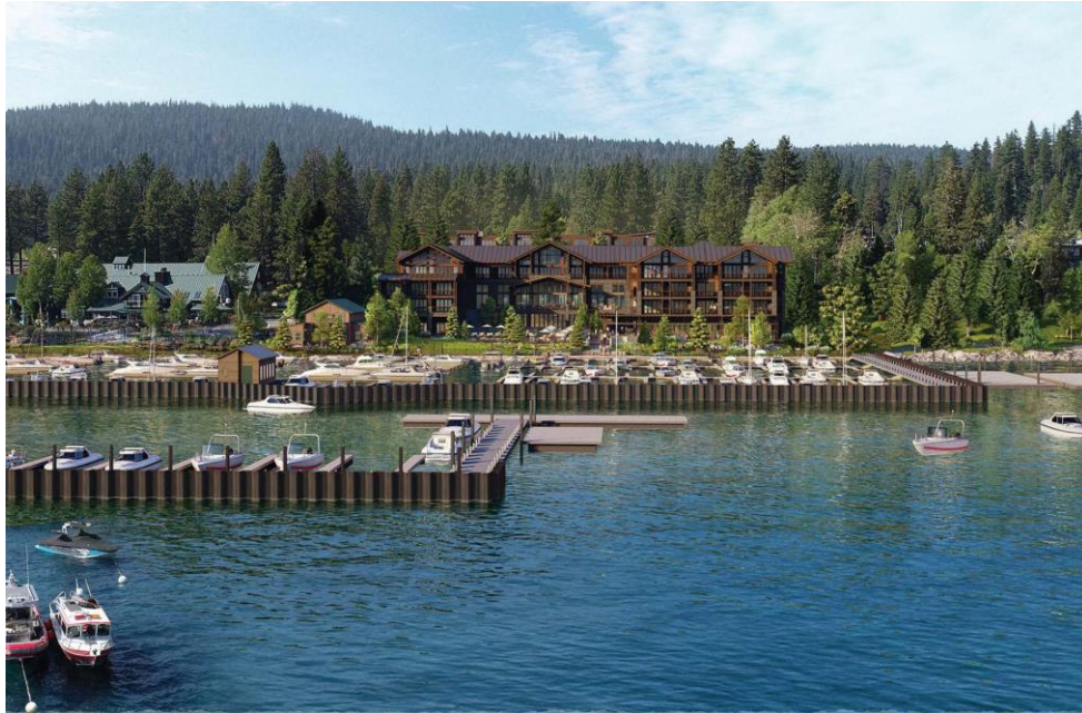
View of hotel from Lake Tahoe