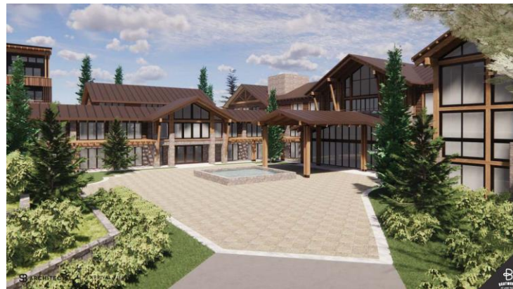
Interior View - Entrance into hotel and condominiums