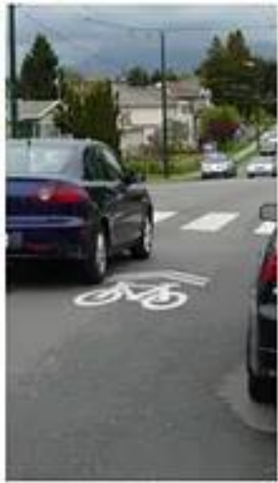
Major Street Shared Use Lane