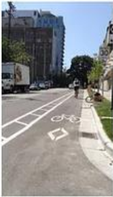
Paint Buffered Bike Lane