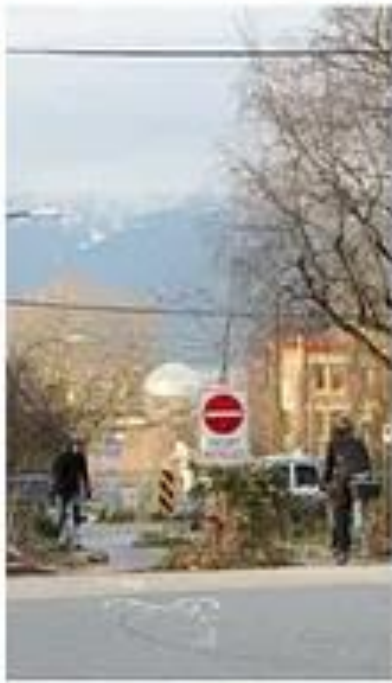
Local Street Bikeway