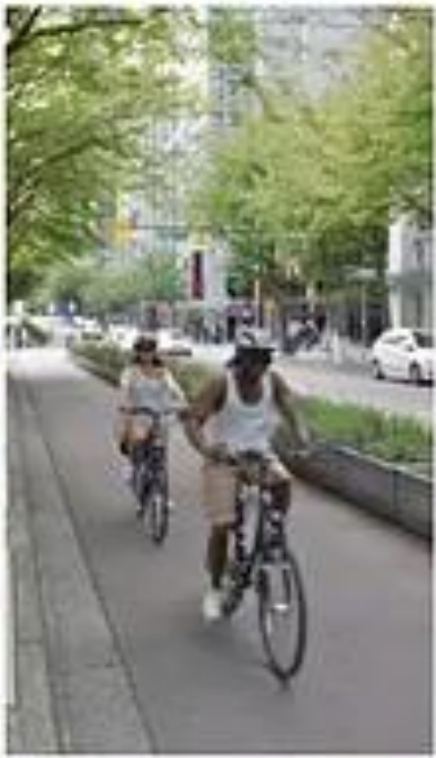
Protected Bike Lane