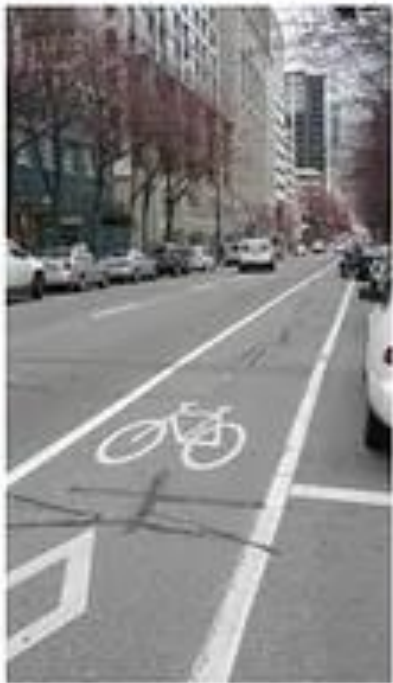
Painted Bicycle Lane