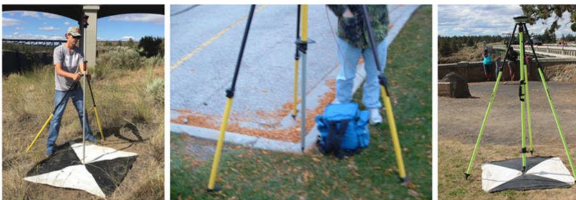
Figure 4. Surveying ground control points (GCPs) for UAS SfM photogrammetry using GNSS and total station.

Assessments of the remotely-sensed data should be performed to assess both spatial accuracy and thematic (classification) accuracy. A variety of methods can be used to assess the positional accuracy, depending on how the remotely-sensed data are georeferenced. In the case of the topo-bathymetric LiDAR, the data will be directly georeferenced using post-processed Global Navigation Satellite System (GNSS)-aided inertial navigation system (INS) on the aircraft, and an empirical accuracy assessment will be performed by land surveyors employed by the remote sensing data acquisition contractor using ground check points surveyed with real time kinematic (RTK) GNSS and/or a total station. The project team should work with the acquisition provider on total propagated uncertainty (TPU) procedures to further assess the LiDAR point clouds. For the UAS data processed in structure from motion (SfM) photogrammetry software, it is more likely that georeferencing will be based on GNSS ground control points (GCPs) distributed throughout the scene (Figure 4) than on direct-georeferencing using precision GNSS (carrier-phase based relative positioning using dual-frequency receivers) with aided INS on the remote aircraft.