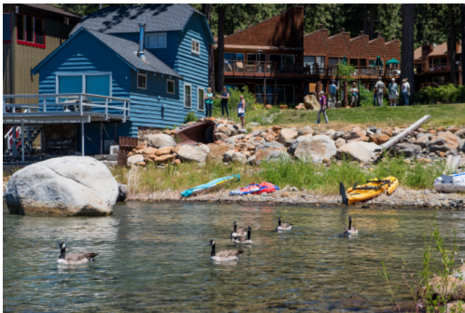
Lower Chipmunk Outfall