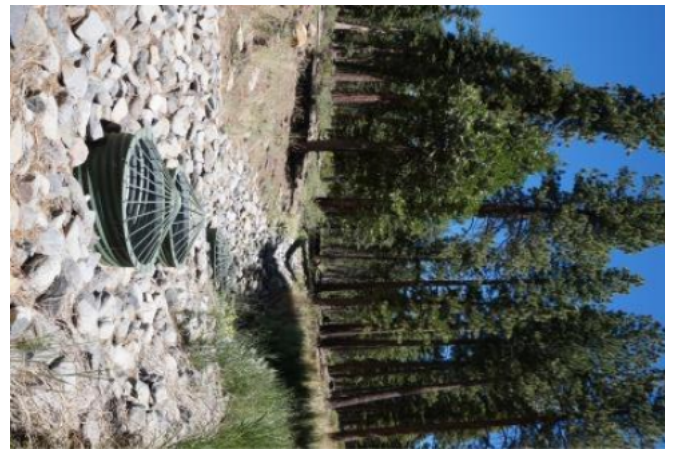
Upper Area of Coon Street Water Pipe Project