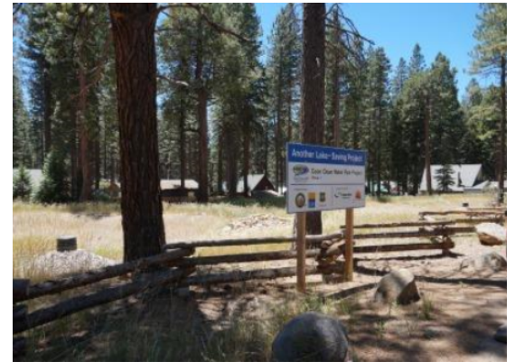
Basin for Coon Street Clean Water Pipe

Drainage conveyance stabilization, revegetation, road runoff treatment, and pavement of unpaved roadways in Kings Beach. This project is being implemented through different phases including the Coon Street Clean Water Pipe, the Lower Chipmunk Project, and the Lower Secline Project. The Lower Secline project is currently undergoing implementation and includes the paving of Lower Secline and Brockway Vista Ave which are unpaved or in poor condition in close proximity to the lake. The intent of the project is to pave the existing dirt roads, stabilize road shoulders, formalize parking on unimproved surfaces and install water quality improvements to reduce the quantity of sediment transport.