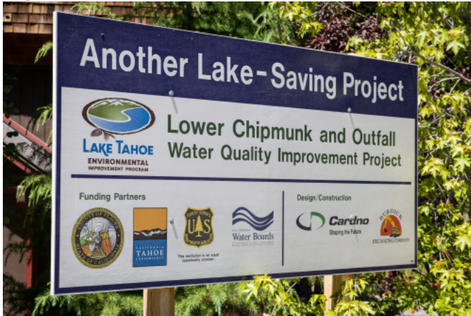
Project Sign for Lower Chipmunk