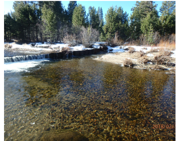
View in the southwesterly direction across the Upper Truckee River, near 38.8574, -120.0270.