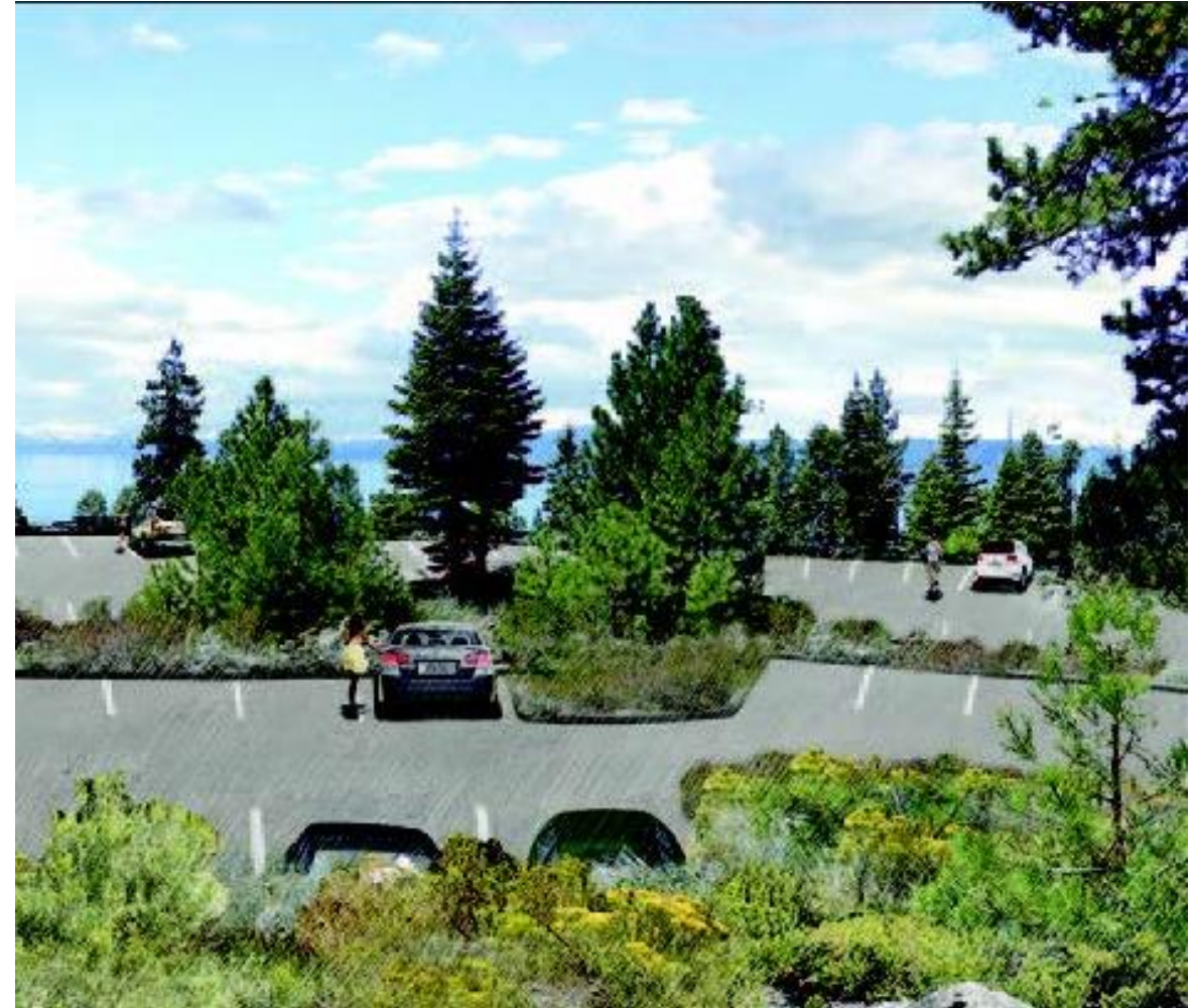
Conceptual Illustration of parking at the Secret Harbor Trail