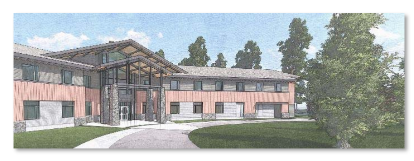
Rendering of the proposed Lake Tahoe Community College housing facility.

TRPA Local Government Coordination Program staff are working with LTCC and the City of South Lake Tahoe