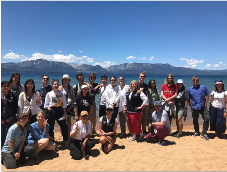
A delegation of European scholars at the University of Nevada, Reno visited TRPA in early July.

Basin. A presentation of the results from this effort is planned for the Governing Board and APC this fall.