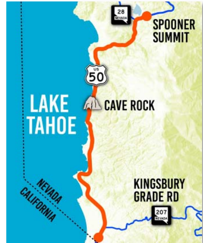
Map of the US 50 East Shore Corridor Management Plan.

Transportation Action Plan: The Bi-State Consultation on Transportation endorsed the final Transportation Action Plan outlining the funding strategy and priority projects to fill the $20 million per year funding gap in the Lake Tahoe Regional Transportation Plan. With endorsement of the action plan, partners will shift their focus to implementation including a formal funding request to the Nevada legislature, analysis of corridor zonal pricing, and submittal of grant applications.