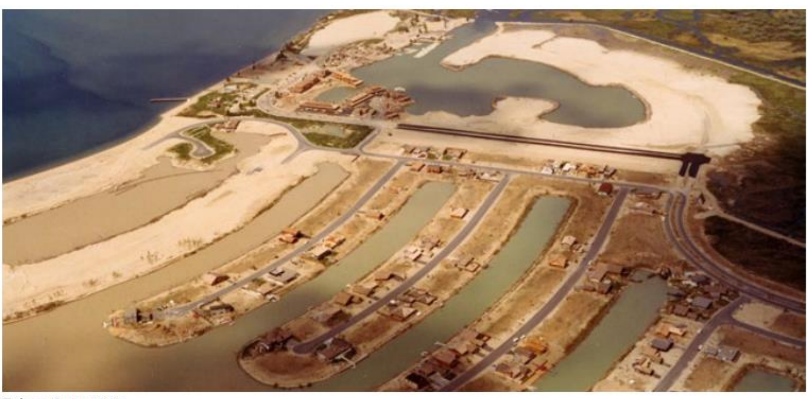
Tahoe Keys, 1966