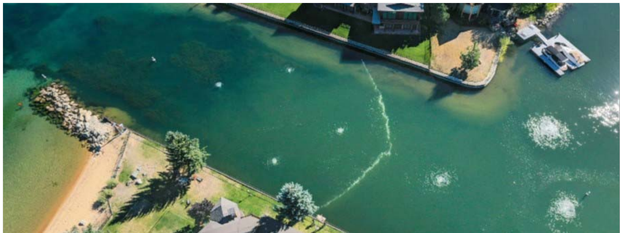
Underwater aerators and a bubble curtain being used to fight aquatic invasive weeds in the west channel of the Tahoe Keys.

Following years of study, planning, and collaboration with a range of stakeholders, this quarter both the TRPA Governing Board and Lahontan Regional Water Quality Control Board voted unanimously to certify environment studies and approve permits for the Tahoe