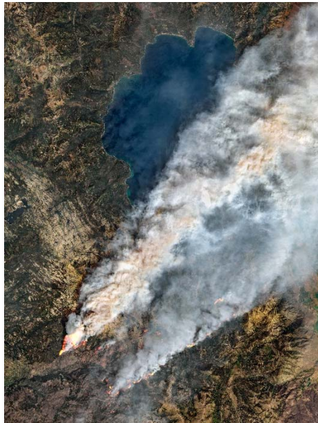
Collaborative wildfire actions spared Tahoe communities from the 2021 Caldor Fire.

With the growing severity, length, and intensity of wildfire seasons, forest managers and fire agencies at every level have been looking hard at the efficiency of forest management