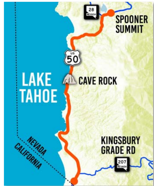
Map of the US 50 East Shore Corridor Management Plan.

The TRPA transportation team this quarter gave additional support to the Nevada Department of Transportation to create the first US 50 East Shore Corridor Management Plan. The plan will develop alternative designs to improve roadway safety, transit, trails, and innovative mobility options between Spooner Summit and Stateline on the South Shore. TRPA assisted the project team develop alternative concepts and unique solutions for each segment of the corridor based on data and stakeholder input. Corridor management plans along the Tahoe Basin's major recreation routes are a significant component of the Regional Transportation Plan. A final US 50 Corridor Management Plan is expected by the end of the year.