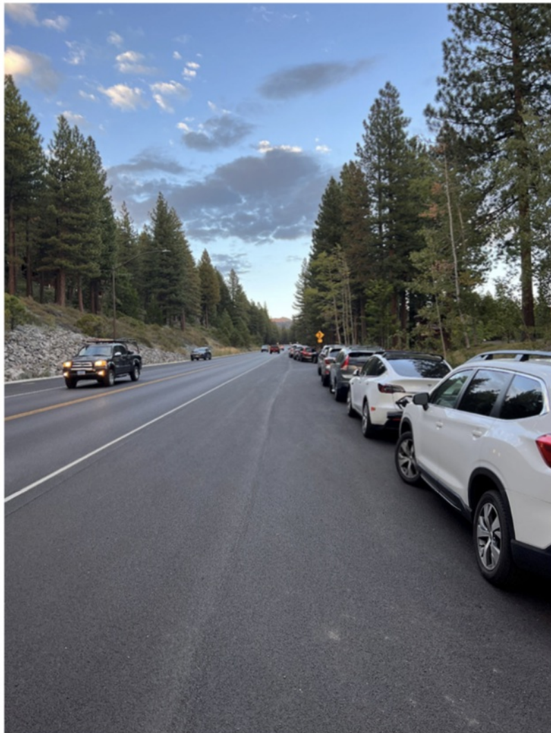
This is standing at the stop sign on Kelly Dr looking east up Mt. Rose Hwy.