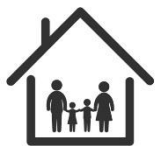
Single Family for Sale