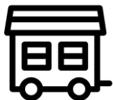
Mobile Homes & Tiny Homes