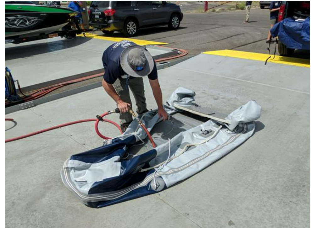
Agenda Item VIII.A