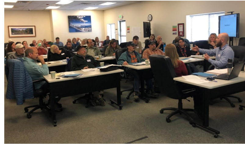
2018 TRPA Permit Review Training