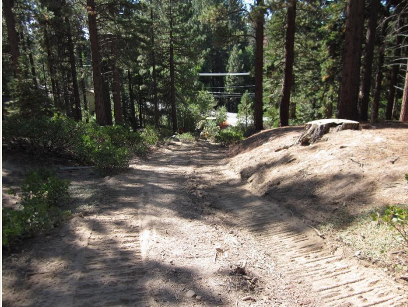
Maintenance road before restoration

Same area 3 years after restoration 7,851 sq. ft of verified restored coverage