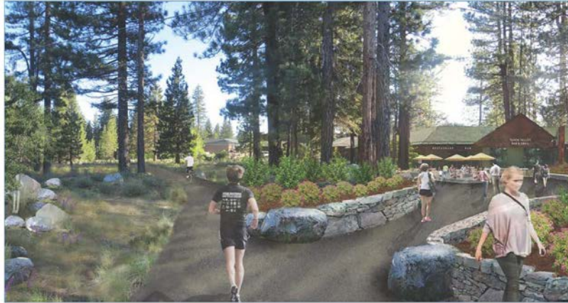
Tahoe Valley Area Plan Initial Study/Initial Environmental Checklist March 16, 2015